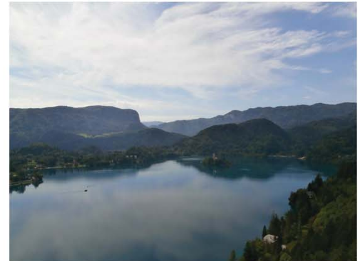
View from Castle, Lake Bled, Slovenia

Tom, Gemma, Max (5) and Harry's (0) Road Trip 2012 Volkswagen T3 Syncro 1.9 TDI Westfalia Club Joker Destination: Croatia. Total Countries: 9 Total distance: 2250 miles. Duration: 21 days